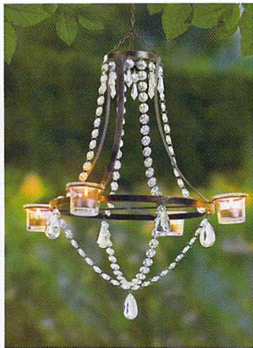
TEALIGHT CHANDELIER Grasslands Road / Amscan, Inc. 800-444-8887 www.grasslandsroad.com