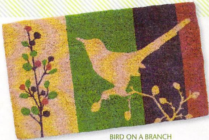
BIRD ON A BRANCH DOORMAT Imports Unlimited Corp. 609-704-9900 www.wholesaledoormats.com