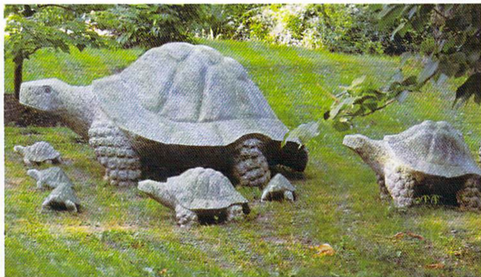
GALAPAGOS TORTOISES Stone Age Creations, Ltd. 419-929-2240 www.stoneagecreations.com