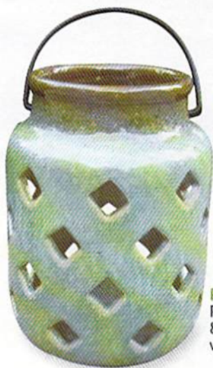
PORCELAIN LANTERN Phoenix Enterprises 864-322-9700 www.phoenixent.net

Inspire your customers by coordinating a local garden walk or partnering with an established one in your area. End the walk at your store, and serve light refreshments. After touring fabulous outdoor spaces, customers will be ready to add to their own.