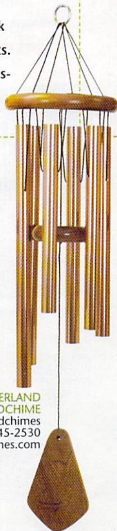
WEATHERLAND WINDCHIME QMT Windchimes 800-345-2530 www.qmtwindchimes.com