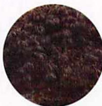
red-leaf Japanese maple